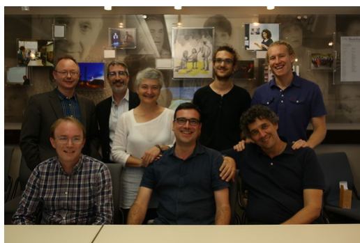
Holocaust Geographies Collaborative November 2016 Read more here .