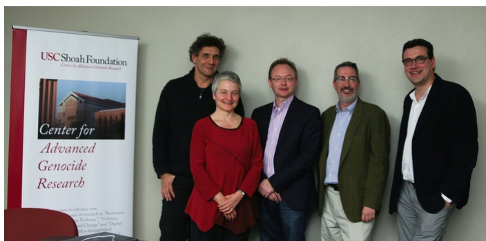
Holocaust Geographies Collaborative (US and UK) January 2016 Read more here .