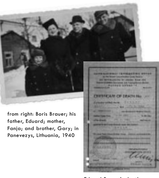
Eduard Brauer's death certificate issued in 1946 from the International Information Office for the former concentration camp Dachau